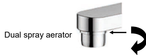
Dual spray aerator