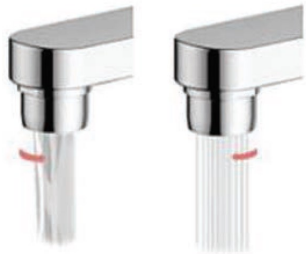
Dual Spray Aerator Twist to change

SINK MIXER - MAINS PRESURE Fitted with the dual spray aerator .